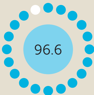
Average ATAR of the top 50% of our IB Diploma students