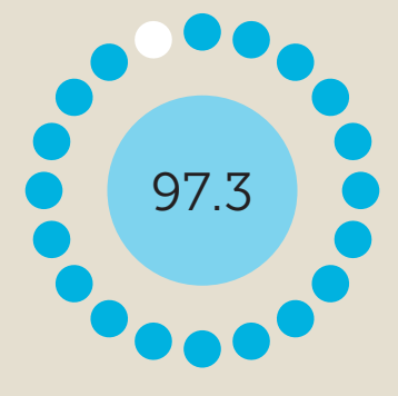
Average ATAR of the top 50% of our IB Diploma students