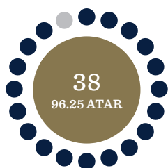
Median IB Diploma score

A total of 32% of all grades by all students were the top grade 7.