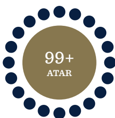
17% of IB Diploma students